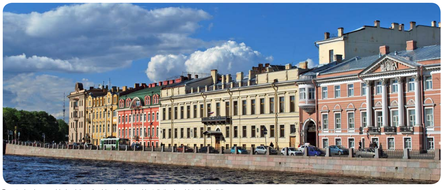
Evac technology enabled quicker plumbing design and installation in a historical building